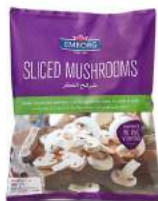
Slice Mushrooms 450g