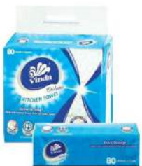
Soft Pack Kitchen Towel 6 x 80's