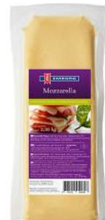
Mozzarella Block 2.38kg