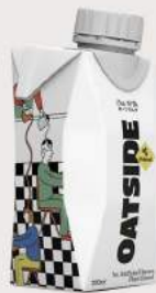
Oatside Barista Blend 200ml