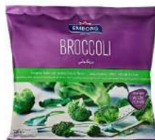
Broccoli Florets 450g