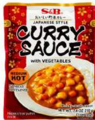
Medium Hot 210g