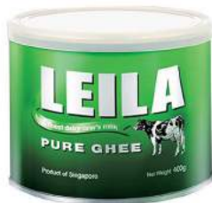
Leila Pure Ghee 400g