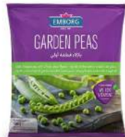
Garden Peas 450g