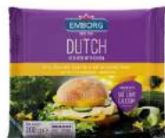
Dutch with Gouda