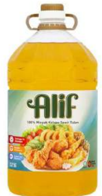
Alif Cooking Oil 5kg