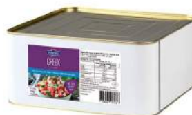
Feta Block 500g