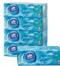
Facial Box Tissue - Blue 4 x 100's