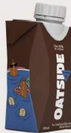
Oatside Chocolate 200ml