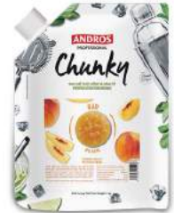
Peach Chunky 1kg