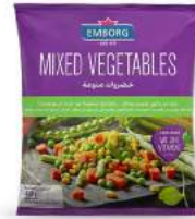
Mixed Vegetables 450g