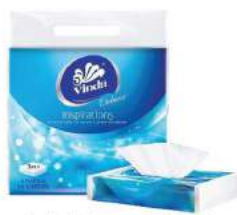
Facial Tissue Soft Pack 4 x 50's