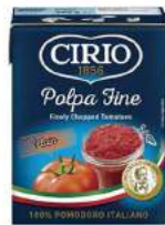
Polpa Fine Chopped Tomatoes Plain 390g