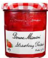
Strawberry Jam 370g