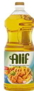
Alif Cooking Oil 2kg