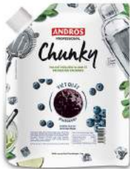
Blueberry Chunky 1kg