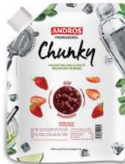
Strawberry Chunky 1kg