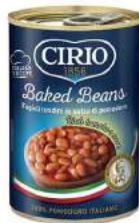
Baked Beans 400g