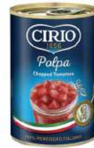
Polpa Chopped Tomatoes 400g