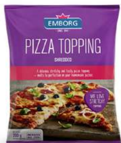
Pizza Topping 200g