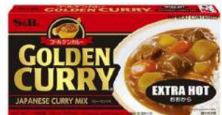
Extra Hot 220g