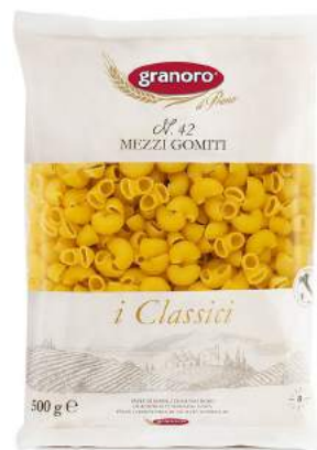
Mezzi Gomiti / Elbows 500g