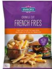
French Fries (Crinkle Cut) 1kg