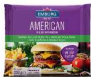
American with cheddar