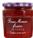
Intense Strawberry Jam 335g