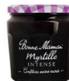
Intense Blueberry Jam 335g