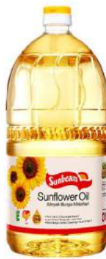
Sunbeam Sunflower Oil 2Litre