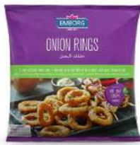
Onion ring 450g