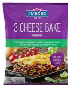
3 Cheese Bake 200g