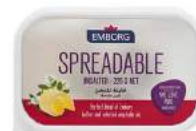
Spreadable Butter (Unsalted) 225G