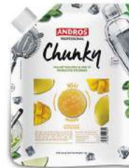
Mango Chunky 1kg