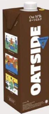
Oatside Chocolate 1 Litre