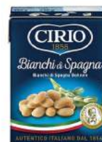
Butter Beans 380g