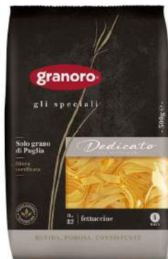
Fettuccine (Dedicato Range) 500g