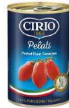
Pelati Peeled Tomatoes 400g