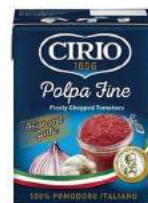
Polpa Fine Chopped Tomatoes Garlic and Onion 390g