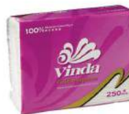
Kitchen Wipes 40's