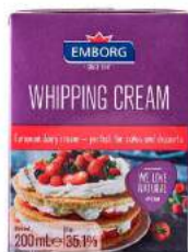
Whipping Cream 200ml