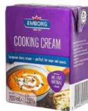
Cooking Cream 200ml