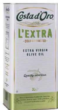
Costa d'Oro Extra Virgin Olive Oil 3L