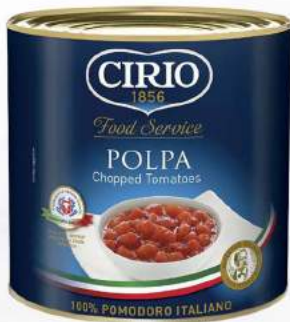
Chopped Tomatoes 2550g