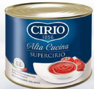
Alta Cucina Supercirio 2100g