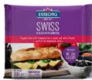
Swiss with Emmental