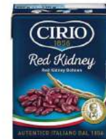
Kidney Beans 380g