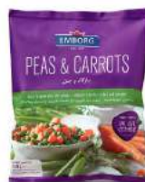
Peas & Carrot 450g