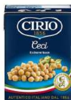
Chick Peas 380g