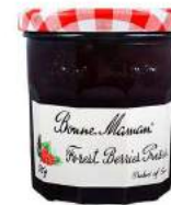
Fruit Of The Forest Jam 370g