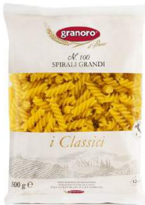
Spirali Grandi 500g