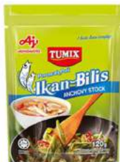
Ikan Bilis 120g