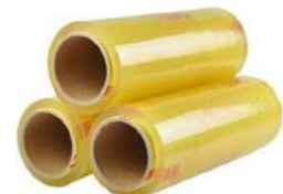
Meat Film (35cm x 500m) (40cm x 500m) (45cm x 500m) (30cm x 500m)