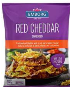
Red Cheddar 200g