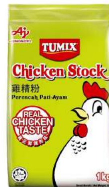
Chicken Stock 1kg