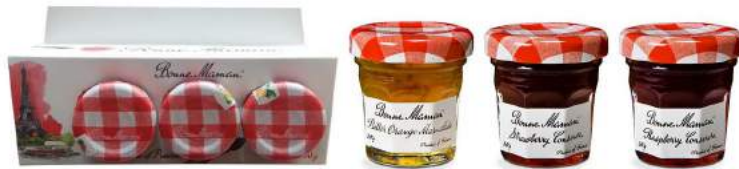
Mini Jar - Pack Of Three(3) 30g Orang Marmalade • Strawberry • Raspberry