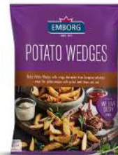
Potato Wedges 750g