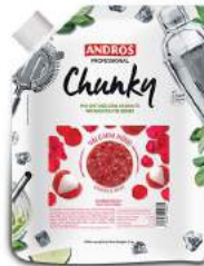
Lychee & Rose Chunky 1kg