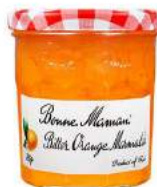
Orange Marmalade Jam 370g