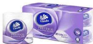
Toilet Roll 4D Deco 3ply 8 Rolls