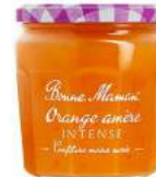
Intense Orange Marmalade Jam 335g