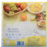
Napkin 100s 40 x 40cm