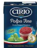
Polpa Fine Chopped Tomatoes Basil 390g