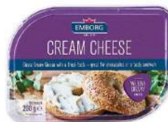
Cream Cheese 200g