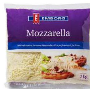
Mozzarella Shredded 2kg