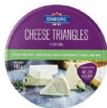
Cheese Triangles 140g