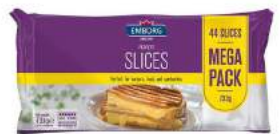
Perfect Slices 44's 733g