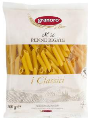
Penne Rigate 500g