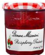
Raspberry Jam 370g