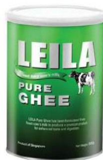
Leila Pure Ghee 800g