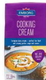
Cooking Cream 1 Litre