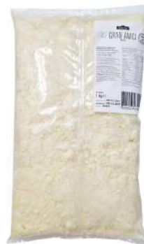
Gran Amici (Grated Parmesan) 1kg