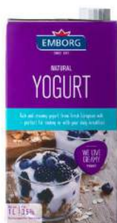
Natural Plain Yogurt 1kg