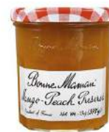
CF Mango & Peach Jam 370g