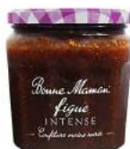
Intense Fig Jam 335g