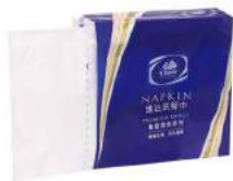
Napkin 23 x 23cm