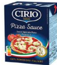
Pizza Sauce 390g