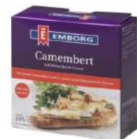
Camembert Soft White Mould Cheese 125g