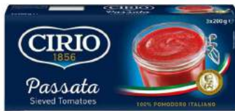
Passata Sieved Tomatoes 200ml