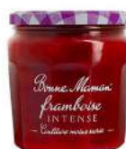
Intense Raspberry Jam 335g