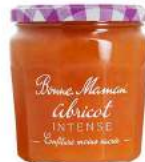
Intense Apricot Jam 335g