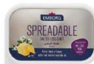
Spreadable Butter (Salted) 225G