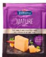
Mature Cheddar 200g