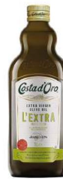
Costa d'Oro Extra Virgin Olive Oil 1L