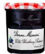
Blueberry Jam 370g