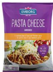
Pasta Cheese 200g