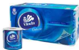
Toilet Roll SF 3ply 16 Rolls