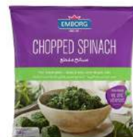
Chopped Spinach 450g