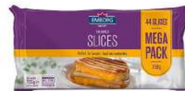
Perfect Slices Coloured 44's 733g