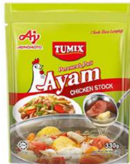
Chicken Stock 330g