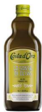
Costa d'Oro Pomace Oil 1L