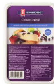
Cream Cheese 1.5kg