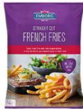
French Fries (Straight Cut) 1kg