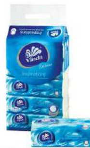
Soft Pack Facial Tissue - M 5 x 90's