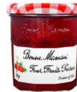
Four Red Fruits Jam 370g