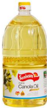
Sunbeam Canola Oil 2Litre