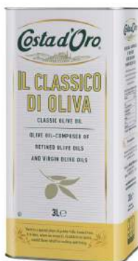
Costa d'Oro Olive Oil 3L