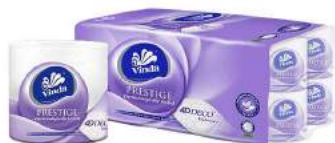
Toilet Roll 4D Deco 3ply 16 Rolls