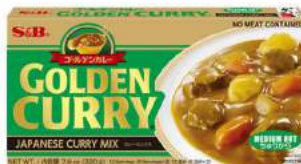
Medium Hot 220g