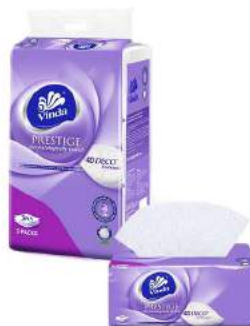
Facial Tissue 4D - Small 3 x 100's