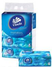
Facial Tissue Soft Pack 4 x 120's