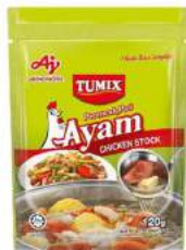
Chicken Stock 120g