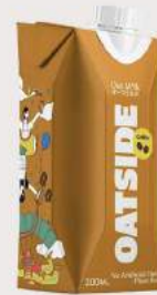
Oatside Coffee 200ml