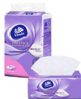
Facial Tissue 4D - Medium 3 x 110's