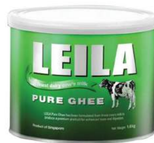
Leila Pure Ghee 1.6kg