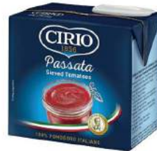
Passata Sieved Tomatoes 500ml