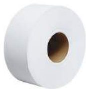
Jumbo Toilet Rolls 240cm