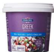
Greek Style Cheese 200g