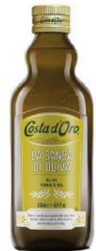
Costa d'Oro Pomace Oil 500ml