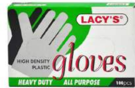
HDPE Gloves 100pcs