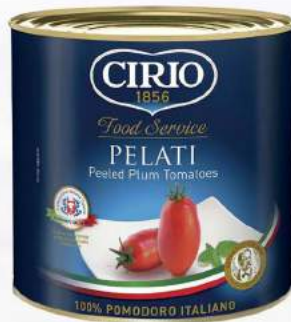
Peeled Tomatoes 2550g