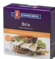
Brie White Mould Cheese 125g