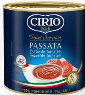
Passata Tomatoes 2550g