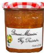
Figs Jam 370g