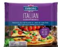
Italian Sliced with Mozzarella