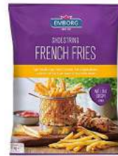
French Fries (Shoestring) 1kg